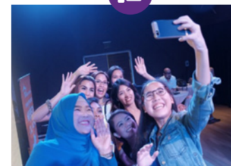
Youth ambassadors for the Future of Young Pinays Campaign by Edukasyon.ph take photos during the launch of the campaign in 2018.

In 2018, IW supported Edukasyon for the Future of Young Pinays (Filipino Women) campaign, which brought together and profiled a group of 10 young women in male-dominated education pathways and careers to inspire women in similar age groups. These youth ambassadors engaged almost 23,000 students in urban centres across the country through campus roadshows and education fairs and reached more than 700,000 on social media with their inspiring stories.