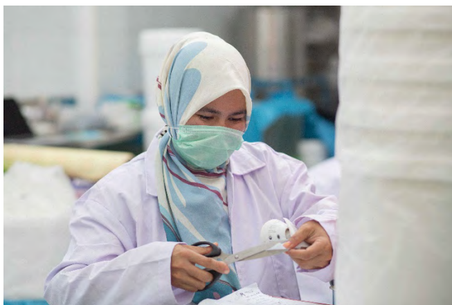
Green Enterprises, Indonesia

Across the capital continuum from grants to commercial capital, all types of investments are needed to strengthen agricultural market systems, depending on the market