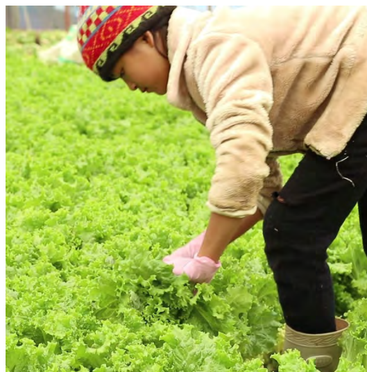
A Farmer from Livegreen Supply Chain, Philippines

Women play an important role across the agricultural sector, yet private sector investments in women-led agribusinesses are often constrained by perceived risks due to prevalent and adverse gender norms. With specific mandates to invest in women's SMEs, the Investing in Women program has strengthened the business case for gender lens investing. Targeted gender lens technical assistance support to the program's investing partners tackled the entrenched gender biases in the financial markets.