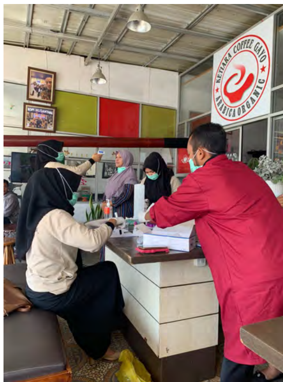
Kopepi Ketiara Cooperative, Indonesia