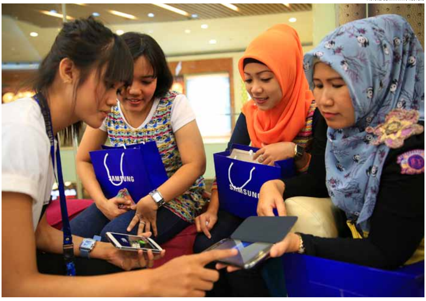
Users in Jakarta listen as an instructor shows them how to use their new smartphones. The average level of internet use in Asian countries between 2000 and 2016 increased from around 6 per cent to almost 54 per cent of the population, a change driven largely by mobile phone penetration.

that human rights apply online as they do offline.