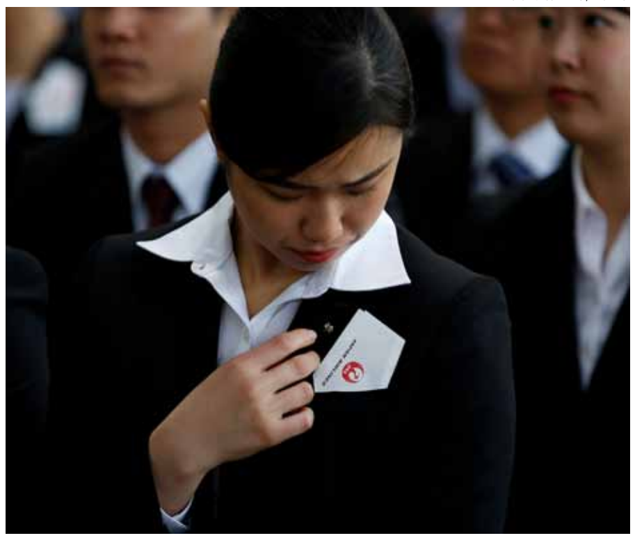
A new Japan Airlines employee checks her uniform at the company initiation ceremony in Tokyo. The number of women in non-regular employment is one reason for Japan's gender wage gap.

of women managers after 2013 when 'womenomics' policies were introduced, the gap remains large.