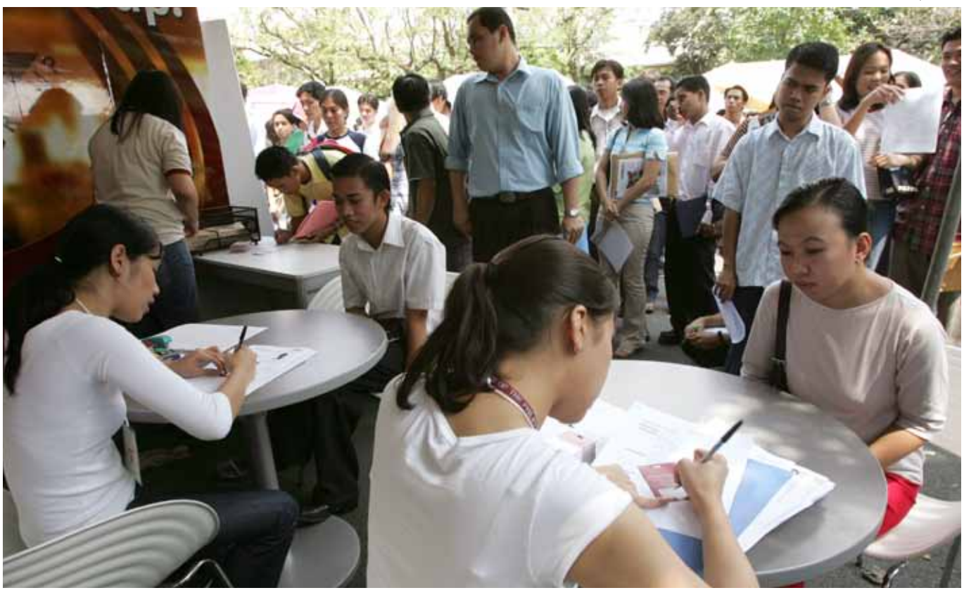
Filipinos being interviewed at a jobs fair for outsourced work in Manila. Women-friendly initiatives can improve female employees' commitment to the firm.

practices should lead to greater gender diversity at various departments and multiple levels of the organisation. These practices demonstrate the value an organisation places on the contribution of its female employees as they are potentially rewarded with more opportunities to increase their pay and human capital. In turn, female employees should reciprocate with greater commitment to their employer.