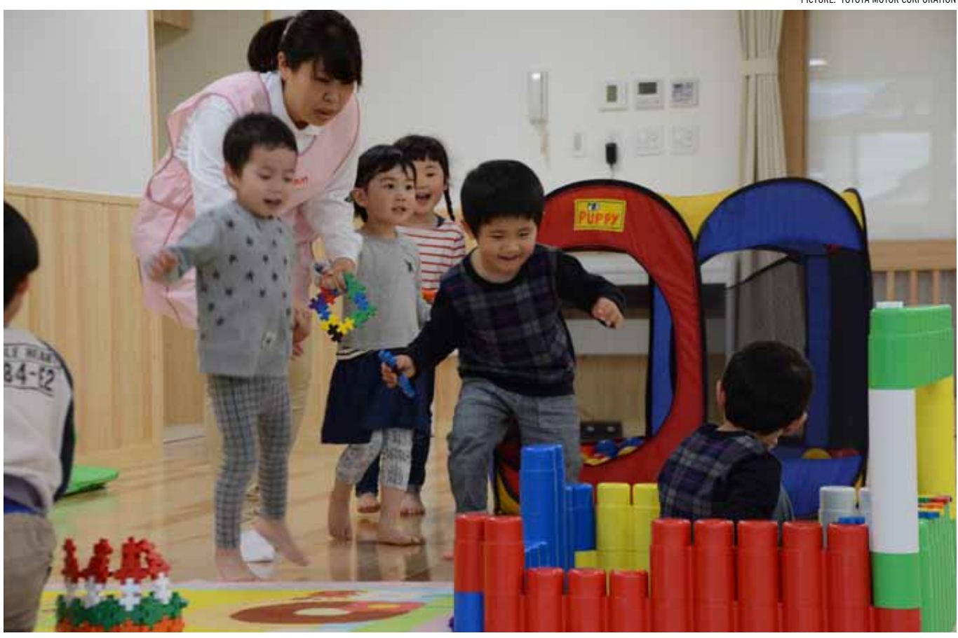
Playtime at a Babu Land childcare centre at a Toyota plant in Japan. High-quality daycare has proved to be a boon to working parents.