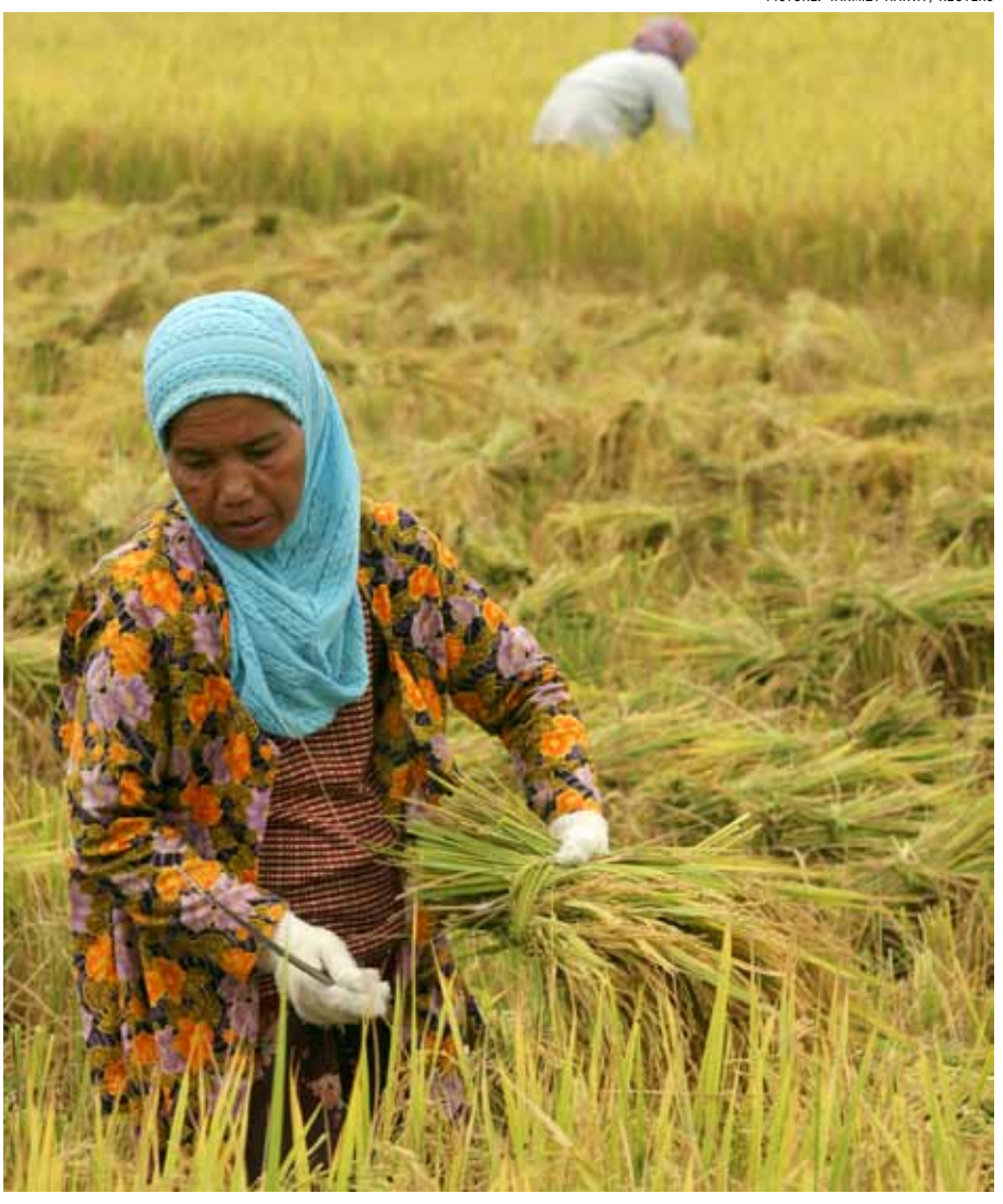
Harvesting rice in Indonesia's Aceh province: civil society organisations are changing expectations.

decision-making forums, review and evaluation working groups, and district-level planning forums. In one district in East Java their schools have been so successful that the district government is now investing in the program so that it can reach more villages.