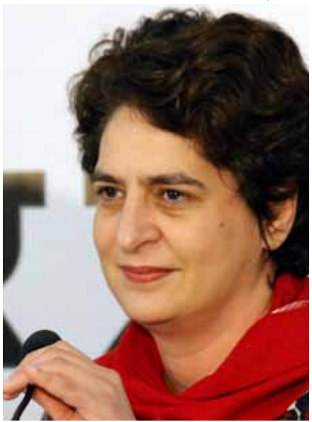
Priyanka Gandhi Vadra: a potentially powerful attraction for women voters.

Modi and the BJP believe they have a following among devout Hindu women who like the idea of a strong Hindu leader as embodied in Modi. The government has also instituted a program, popular among women in north India, of providing subsidised gas cookers to poor families. The cookers save women hours of labour collecting fuel for open fires and spare them the inhalation of harmful smoke.