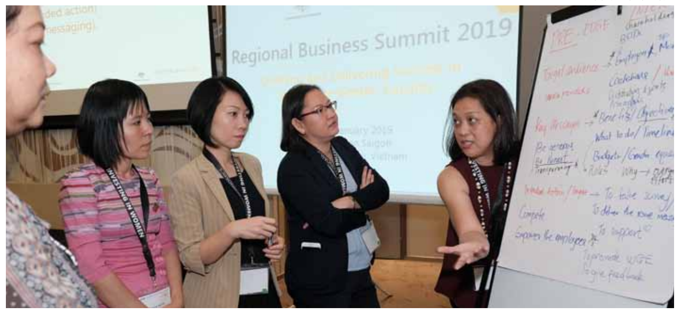
Participants work over strategies at the Investing in Women 2019 Regional Business Summit on Gender Equality, held at Ho Chih Minh City for business leaders and human resource specialists from around Southeast Asia. Having an entrepreneurial mindset is critical to women's business success.

Scaling-up of SMEs may take place after the start-up phase, but can also occur at other points in a firm's life. A company might scale up in response to a major increase in demand, to bolster its competitive position, or to seize new market opportunities.