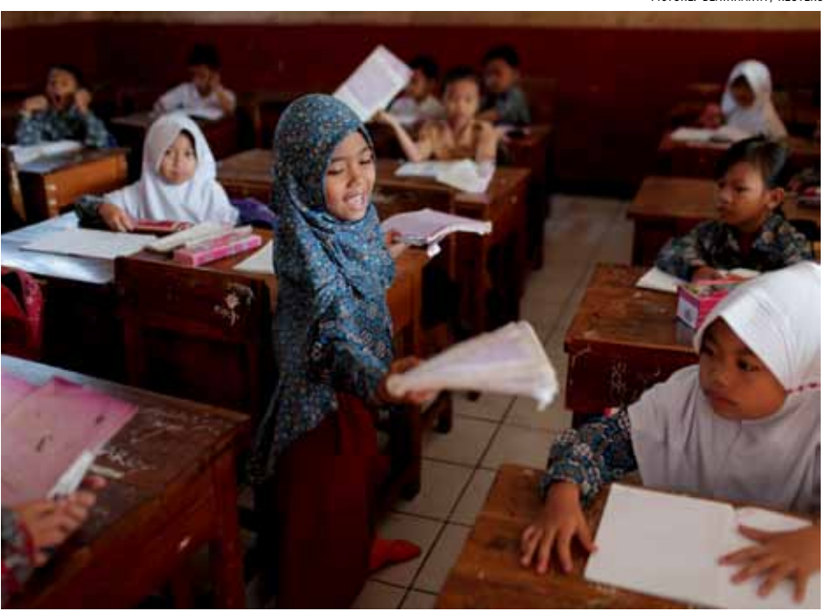
Students in class at a school in Cikawao village, Majalaya, in Indonesia's West Java province. Indonesian courts tend to hand down heavy sentences for sexual misconduct by teachers.

The United Nations defines sexual harassment as unwelcome behaviour of a sexual nature. It can take the form of an unwelcome sexual advance, a request for sexual favour, verbal or physical conduct or a gesture of a sexual nature, or any other behaviour of a sexual nature that might reasonably be expected or be perceived to cause offence or humiliation to another.