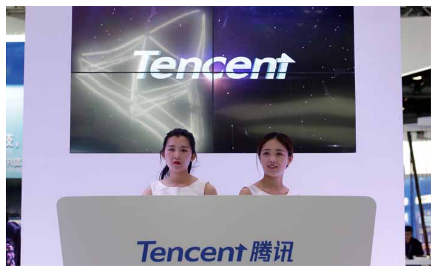
A Tencent welcome desk at the Global Mobile Internet Conference in Beijing in April 2017. The availability of cheap and affordable smartphones has brought the internet revolution to lower-income Asian countries, and created new tech billionaires along the way.

A second (and related) challenge is the protection of privacy, which appears to be a novelty in many Asian jurisdictions. Approximately 10 billion data records have been breached in various attacks since the early 2000s. In response, countries like Japan, China, South Korea and Singapore have followed a European legal model that restricts access to personal information from abroad. Businesses must protect customer data, hire data protection professionals and alert the authorities of breaches. Meanwhile, other governments such as Thailand, Cambodia and Laos are yet to implement regulations that recognise the idea of personal information.